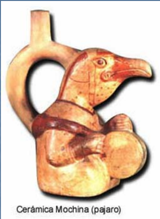
Cerámica Mochina (pajaro)